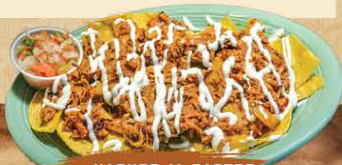
NACHOS AL PASTOR