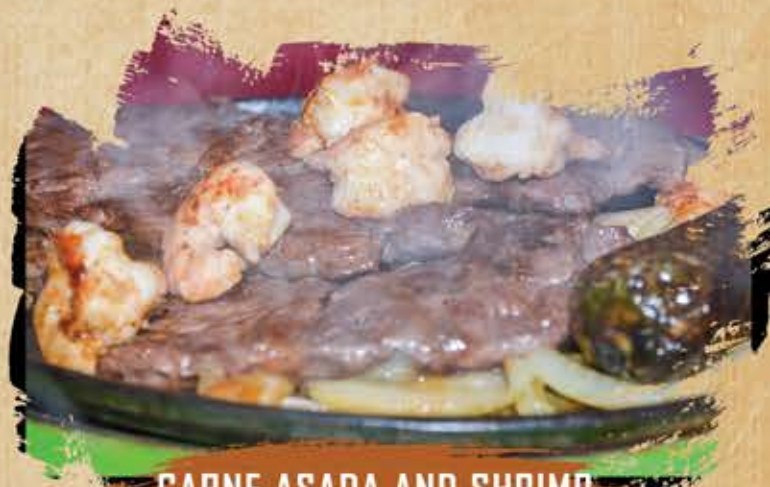
CARNE ASADA AND SHRIMP