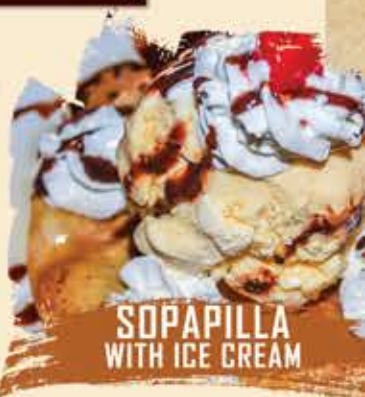
SOPAPILLA WITH ICE CREAM

Churros are light, crispy sweet treat served with a dusting of cinnamon, honey, and chocolate. Served with ice cream. 5.99