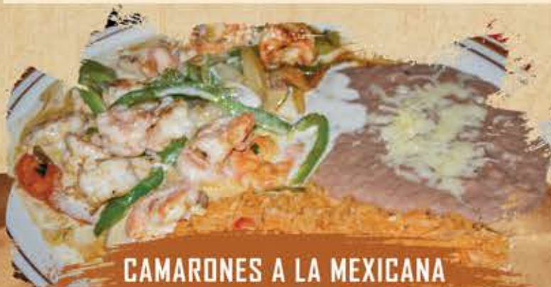
CAMARONES A LA MEXICANA