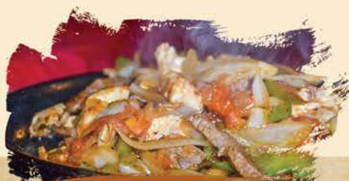
BEEF OR CHICKEN FAJITAS

SHREDDED CHEESE 1.99 CILANTRO 1.00 GREEN SAUCE 1.50 SOUR CREAM 1.25 DICED ONIONS 1.00 LIMES 1.00 LEMONS 1.00 FAJITA VEGETABLES 3.75 CALIFORNIA VEGETABLES 4.00 PICO DE GALLO Diced tomatoes, onions, and cilantro. 1.99 QUESADILLA Grilled chicken or beef 4.75 Shrimp 5.75 BURRITO Grilled chicken or beef. Covered with cheese dip. 5.50 Shrimp 6.75