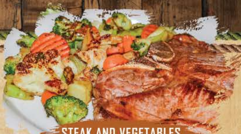
STEAK AND VEGETABLES